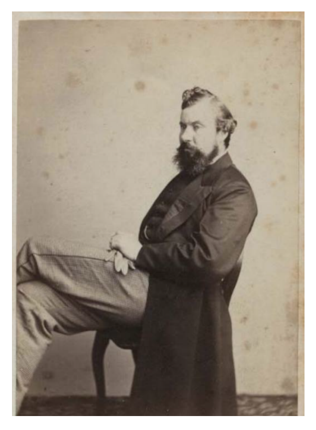
RHS Lindley Collections

More information and tickets: <a href="https://">https://</a> <a href="https://">https://</a> <a href="https://">londongardenstrust.org/whatson/talks/the-early-life-of-alexander-mckenzie-the-19th-century-horticulturist-and-landscape-designer/</a>