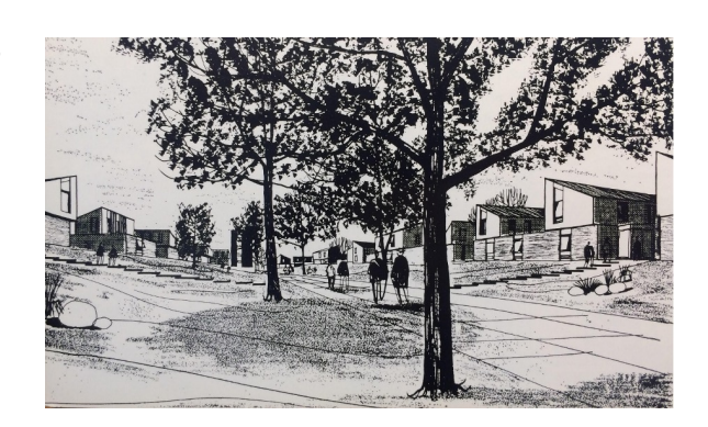
Illustration from John Madin's plan for Telford

Five talks on post war housing and development to complement FOLAR Nov 2022 symposium - Landscape for Housing. Details on next page: