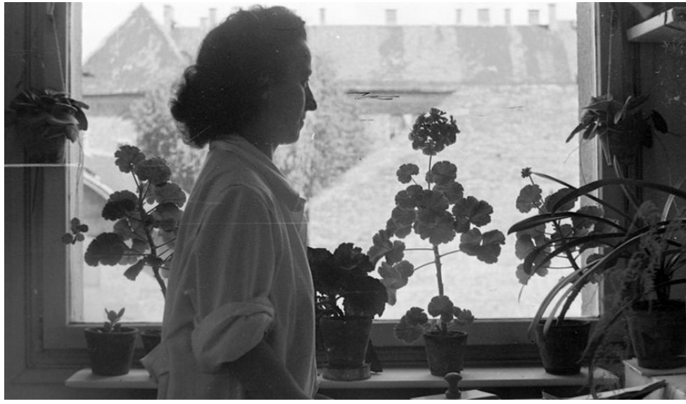
Conference Visions of Welfare 2023

https://gardenmuseum.org.uk/events/conference-visions-of-welfare-2023/