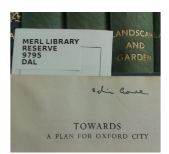
Sylvia Crowe signature in Lawrence Dale's 1944 Towards a plan for Oxford City