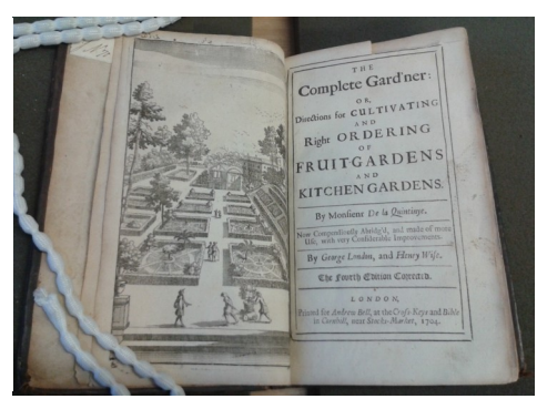
Above: Title page, The Complete Gardener,

'In essence, we would consider a book rare (and therefore suitable for closed, rather than open access) due to its age, scarcity, edition, market value, physical attributes (e.g. bindings), condition, provenance or historical interest.'